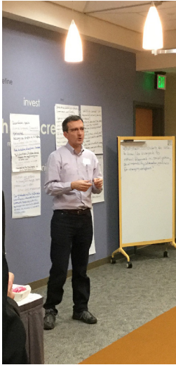
Our fearless leader